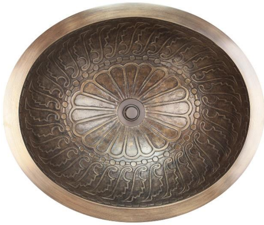
Shown in AB

Linkasink warranties our product to be free from manufacturing defect for the life of the product. Warranty does not cover improper care, neglect or abuse or normal wear-and-tear