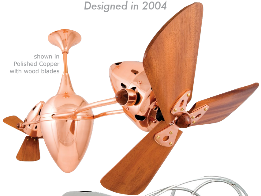
shown in Polished Copper with wood blades