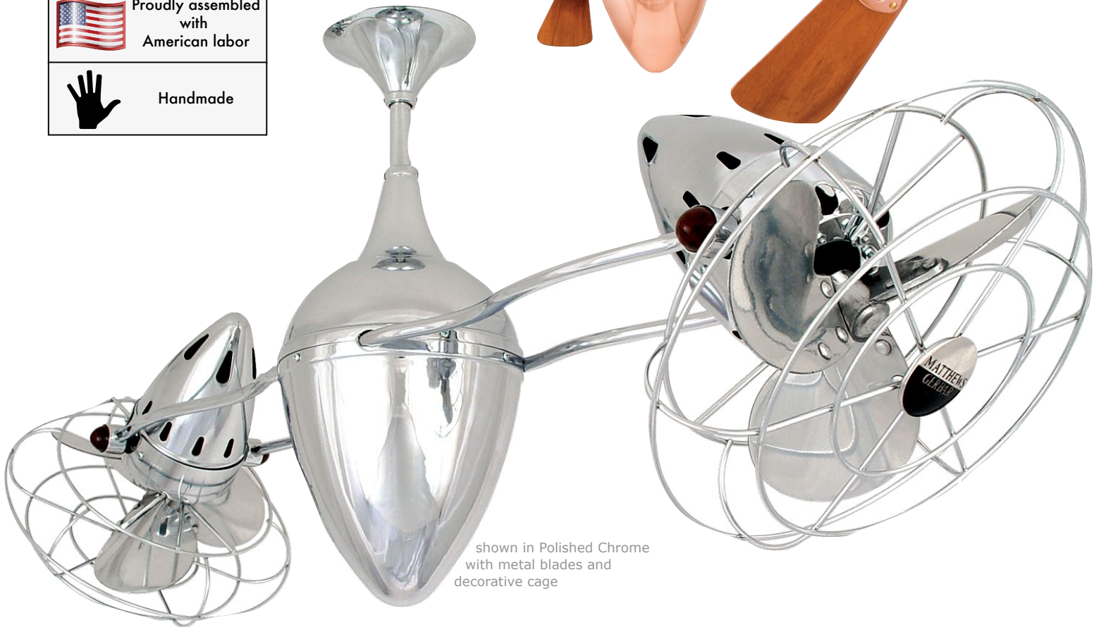
shown in Polished Chrome with metal blades and decorative cage

The Ar Ruthiane's unique hourglass support arms grasp bullet-shaped motor housings which rotate 360° about its teardrop center. The fan heads can be infinitely positioned in 180-degree arcs for optimum air movement; the greater the angles of the motors to the horizontal support rods (up or down), the faster the axial rotation. A slow, controlled axial rotation is achieved by both fan head position and fan blade speed. Matthews 360° rotational fans circulate heat and air conditioning more efficiently than traditional paddle fans. Constructed of cast aluminum, heavy spun and stamped steel, the Ar Ruthiane carries a limited lifetime warranty.