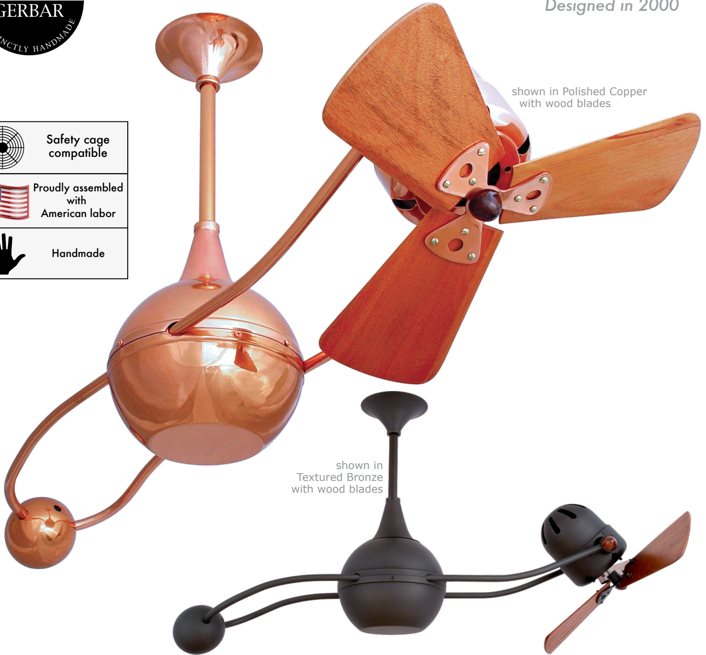
shown in Textured Bronze with wood blades

Like satellites orbiting a planet, the Brista's select mahogany blade head and lunar counterweight gently revolve 360° about its spherical gear housing. The fan head can be infinitely positioned in a 180-degree arc for optimum air movement; the greater the angle of the motor to the horizontal support rods (up or down), the faster the axial rotation. A slow, controlled axial rotation is achieved by both fan head position and fan blade speed. Matthews 360° rotational fans circulate heat and air conditioning more efficiently than traditional paddle fans. Constructed of cast aluminum, heavy spun and stamped steel, the Brista carries a limited lifetime warranty.