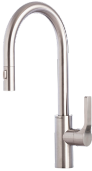
Matte Stainless Steel