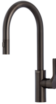
PVD Satin Black Stainless Steel