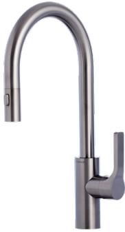
PVD Gun Metal Gray™ Stainless Steel