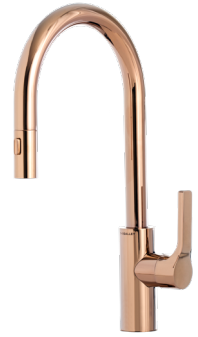
PVD Polished Rose Gold Stainless Steel Limited Edition