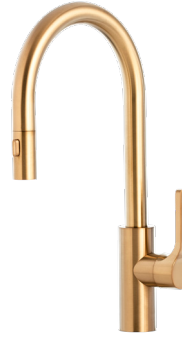
PVD Brushed Gold Stainless Steel Limited Edition