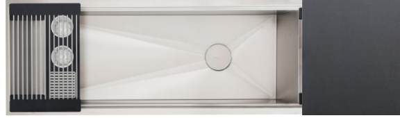
Graphite Wood Composite