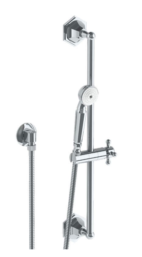
Available in all finishes shown on the Watermark Designs website

Hand Shower: SH-S525BWall Elbow: ELB-6001Shower Hose: DS-4079